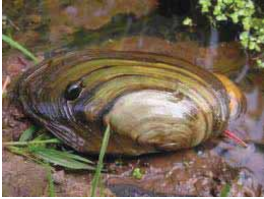
Figure 2. Pearl bearing wild mussel of Bangladesh.