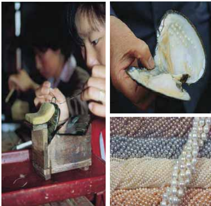
Figure 3. Left: the tissue nucleation technique involving operating a small square strips of mantle tissue into the mantle of a mussel. Right: yield of seed pearls (<4mm) in a C. plicata mussel in China.

One mussel can bear over a dozen grafted pieces, these will result in pearls (Figure 3) (Scarratt, Moses et al. 2000). The pearls can be harvested after two to three years of the initial operation depending on the desired size and quality (FAO 1986). After the pearls are harvested the mussel can be re-grafted up to about 4 or 5 times (especially mussels that produce good quality pearls) producing larger pearls each time, due to the growth and expansion of the original pearl sacks. Pearl mussels can be cultured in ponds, portions of lakes, rivers, irrigation canals or dams. A pond, as a culture site, will have an advantage as water quantity and quality can be controlled. Seven species of pearl mussels from two genera were identified from freshwater bodies of Bangladesh (Pagcatipunan 1984), these species are ( Lamellidens marginalis and L. jenkinsianus var. obesus , Perreysia daccaensis , P. wynegungaensis , P. (Radiatula) pachysoma , P. favidens var. assamensis and P. favidens var. deltae ). The species Lamellidens marginalis is best fit for culturing because of its larger size and common existence in inland water bodies (FAO 1986).